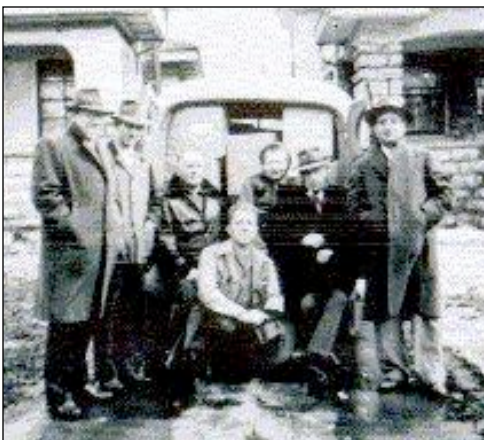
Surrounded by family, the author's grandparents are seated on the left and middle of the truck to take the boxes of arms for Israel to the Kansas City railroad station.

Not long after Israel's War of Independence was launched, a high school friend of my father's returned to Kansas City from a visit to Israel. Enthusiastically, he drafted my father, grandparents and other relatives in a frantic attempt to help the fledgling State of Israel. Just three years after the end of World War II, weapons could be found throughout the community as soldiers who returned home from war often brought with them rifles and other weaponry. My family was determined to gather as many arms as possible and ship them to assist Israel.