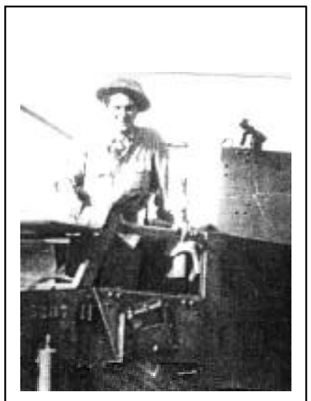
When an armored truck served as a tank