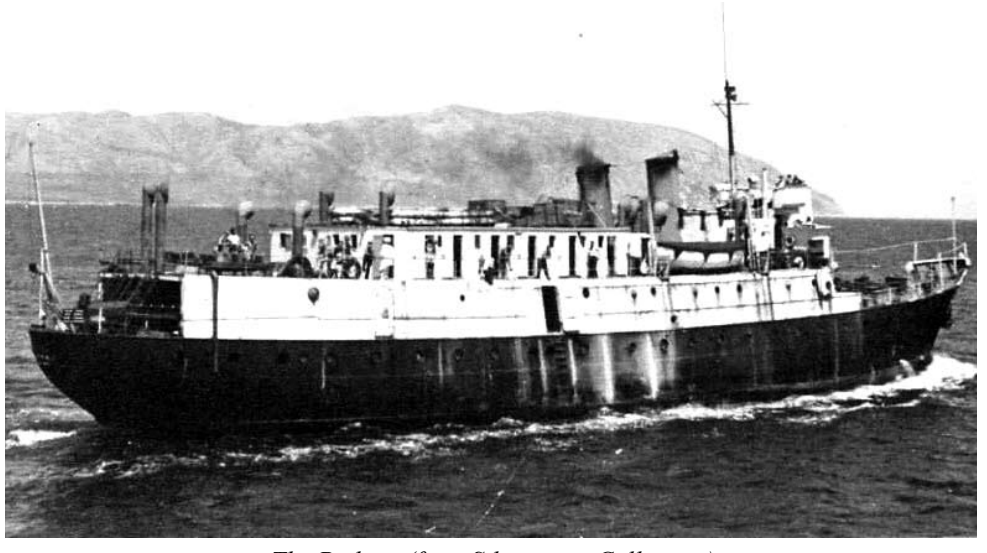
The Paduca

There were many people who had been in Russia; but most shared the opinions of an American Jew, an ex-Wobbly who had jumped ship in