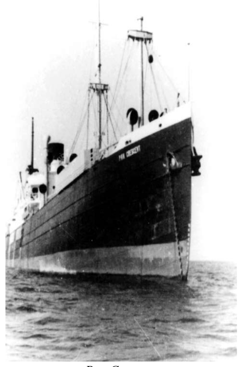
Pan Crescent

Shulman helped to secure a volunteer crew to sail the ships to Philadelphia to be readied for the cross-Atlantic voyage to Europe. To disguise their true mission (and to recover some of the purchase price) the Pan Crescent and Pan York advertised that they would accept cargoes for Europe. Phosphates