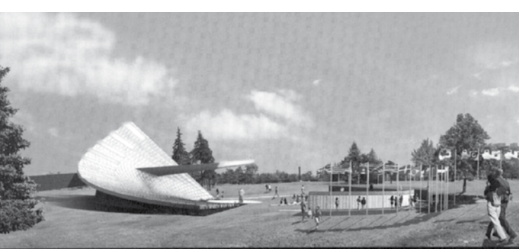
Libeskind Veterans Memorial