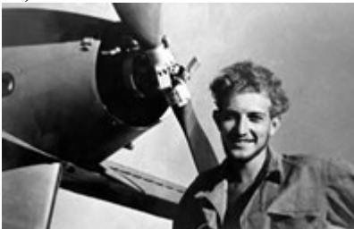
Air Force Pilot Ezer Weizman in 1949.

Ezer Weizman - air force general and politician, nephew of Israel's first President Professor Chaim Weizman, and former President of the State