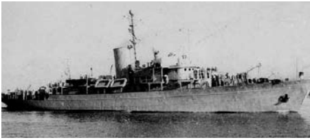
Israeli Naval Patrol Vessel Ma'oz