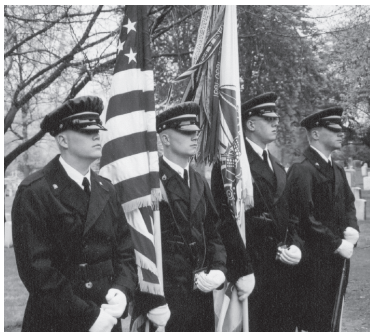
Cadet Honor Guard, West Point Marcus Memorial, 2004

On Sunday May 2nd, AVI held its annual memorial service at the West Point Cadet Chapel to remember David 'Mickey' Marcus and the other volunteers who gave their lives in Israel's War of Independence. The participants that filled the chapel included guests, USMA cadets and members of AVI. Highlights of the event included the lighting of memorial candles