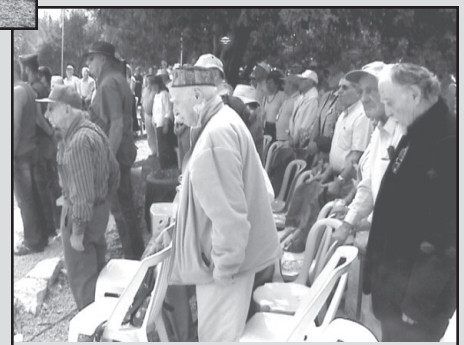
Yom Hazikaron, Israel, 2004