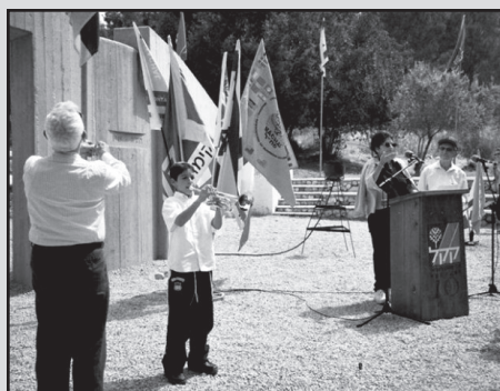
Yom Hazikaron, Israel, 2004