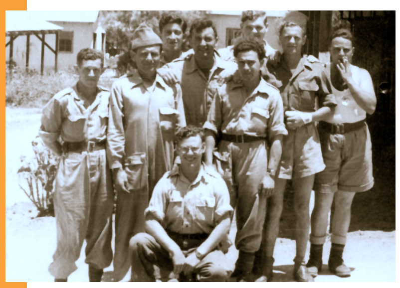
A group of Machalniks, mostly British, in the Alexandroni Brigade.

The overwhelming majority of the volunteers came from English-speaking countries and were generally posted to units according to their skills and war experience. Artillerymen, engineers, signalers and armored vehicle specialists were much in demand. Machal soldiers set up the first artillery units, which included heavy-mortars. From 15th May to early June 1948, British, South African, Canadians and some Americans were posted to the 3rd Brigade (Alexandroni), which also included volunteers from Holland, Denmark and New Zealand. Subsequently, Machalniks were posted to numerous other