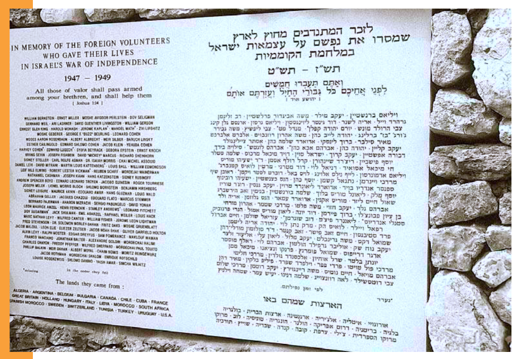
The plaque at the monument in Sha'ar Hagai bearing the names of the fallen Machal fighters.