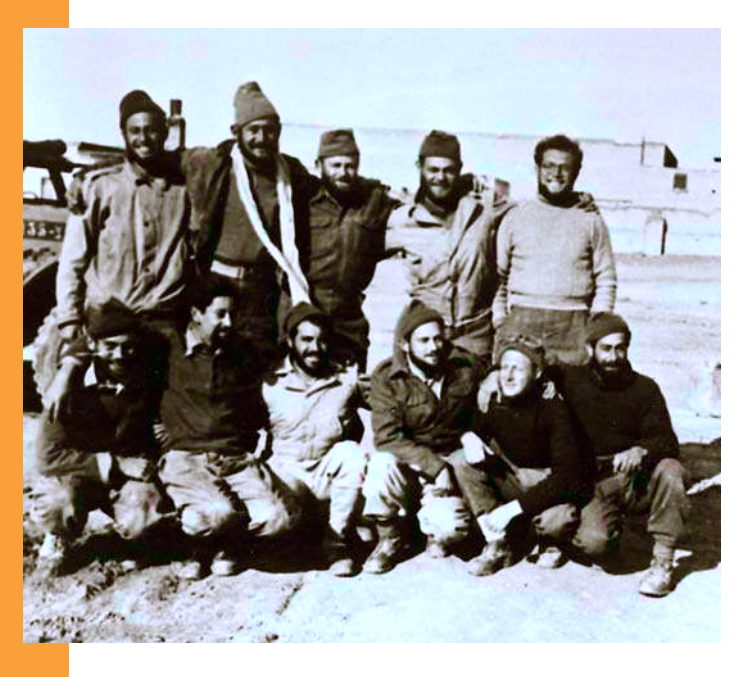
Machalniks of the Armored Car and Jeep Company, 9th Battalion, Palmach Hanegev Brigade, after the capture of Beer Sheba.

This 9th Armored Battalion had a considerable number of Machal English-speakers, including 22 South Africans. Volunteers from France