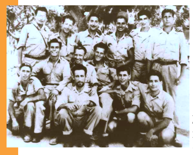
Machalniks who arrived on the Pan York in August 1948. Most were posted to the 7th Brigade.

The first volunteers, some 240 men, operated within the framework of the Mossad l'Aliyah Bet, the organization bringing "illegal immigrants" to Mandatory Palestine. Most of these volunteers were Americans, 16 were