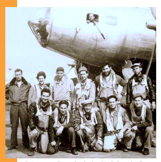
B-17 crew at Zatec, Czechoslovakia, before takeoff.

aircraft mechanics he trained, many of whom later assumed key positions of command.