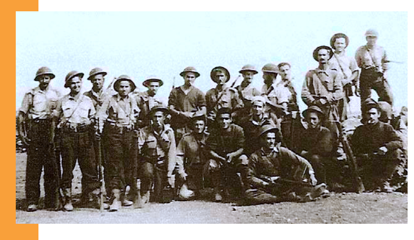
The South American platoon, 91st Battalion in the 9th Brigade.

The first overseas volunteers, several dozen men, arrived in Palestine as early as February 1948. (Twenty-four volunteers fell in battle by May 31, 1948.) The numbers of volunteers grew steadily as the day of the proclamation of the state drew nearer. There was a further spurt in the numbers after the first cease-fire, which ended in July 1948.