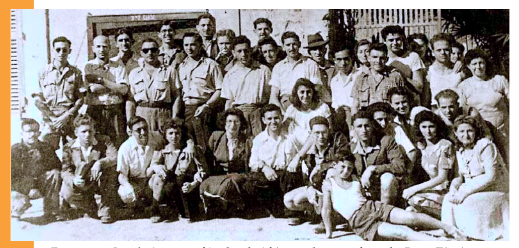
En route to Israel: A group of 25 South African volunteers from the Betar Zionist movement, together with refugees and staff at Ladispoli displaced persons camp, Italy, July 1948.

Machal veterans living abroad maintain ties with Israel through World Machal and its affiliates in many countries.