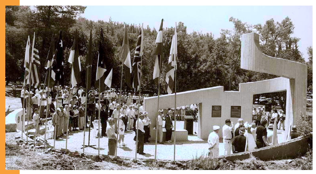
The dedication ceremony of the monument in memory of the 119 overseas volunteers who fell in the War of Independence.